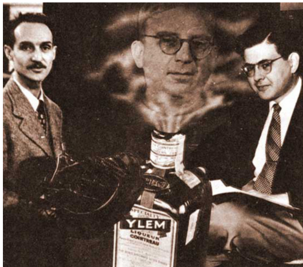
Figure 29.12 George Gamow and Collaborators. This composite image shows George Gamow emerging like a genie from a bottle of ylem, a Greek term for the original substance from which the world formed. Gamow revived the term to describe the material of the hot Big Bang. Flanking him are Robert Herman (left) and Ralph Alpher (right), with whom he collaborated in working out the physics of the Big Bang. (The modern composer Karlheinz Stockhausen was inspired by Gamow's ideas to write a piece of music called Ylem , in which the players actually move away from the stage as they perform, simulating the expansion of the universe.)

published in 1948. (Gamow, who had a quirky sense of humor, decided at the last minute to add the name of physicist Hans Bethe to their paper, so that the coauthors on this paper about the beginning of things would be Alpher, Bethe, and Gamow, a pun on the first three letters of the Greek alphabet: alpha, beta, and gamma.) Gamow's universe started with fundamental particles that built up the heavy elements by fusion in the Big Bang.