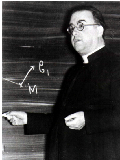
Figure 29.11 Abbé Georges Lemaître (1894–1966). This Belgian cosmologist studied theology at Mechelen and mathematics and physics at the University of Leuven. It was there that he began to explore the expansion of the universe and postulated its explosive beginning. He actually predicted Hubble’s law 2 years before its verification, and he was the first to consider seriously the physical processes by which the universe began.

It is one thing to say the universe had a beginning (as the equations of general relativity imply) and quite another to describe that beginning. The Belgian priest and cosmologist Georges Lemaître was probably the first to propose a specific model for the Big Bang itself (Figure 29.11). He envisioned all the matter of the universe starting in one great bulk he called the primeval atom , which then broke into tremendous numbers of pieces. Each of these pieces continued to fragment further until they became the present atoms of the universe, created in a vast nuclear fission. In a popular account of his theory, Lemaître wrote, “The evolution of the world could be compared to a display of fireworks just ended—some few red wisps, ashes, and smoke. Standing on a well-cooled cinder, we see the slow fading of the suns and we try to recall the vanished brilliance of the origin of the worlds.”